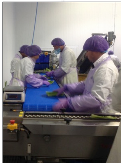
Product formed into stick packs and sent through flow wrapper