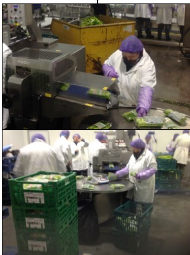
Check Weighing, and Metal Detecting