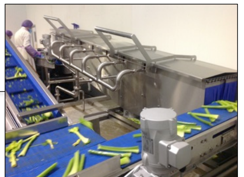
Spray Washer – sterilizing product and Cleaning dirt and grit.