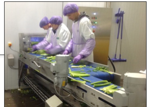
Inspection conveyor – removing unsuitable product