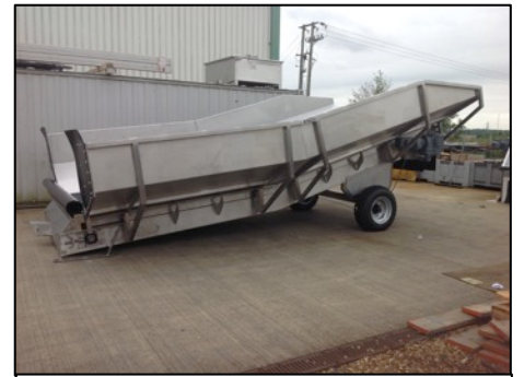
All equipment was manufactured in stainless steel