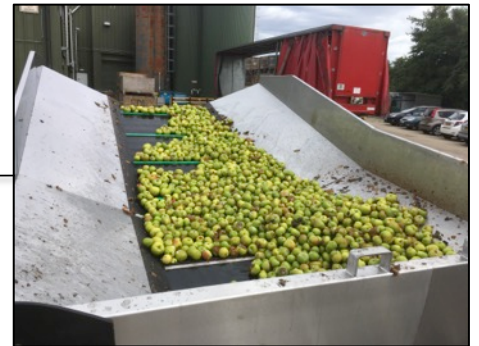
Bulk Hopper – Handles 4000kg, mobile unit can be used in multiple locations