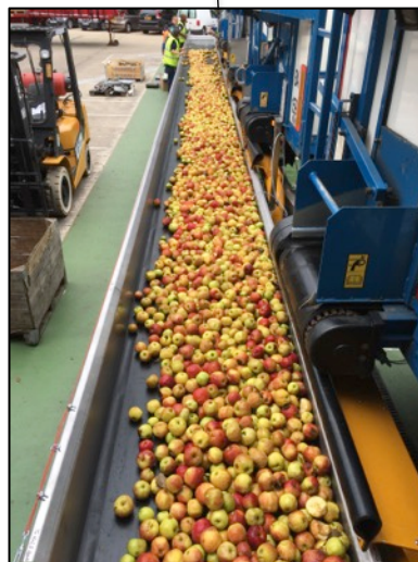
Infeed conveyor transfers lorry discharge to trough elevator