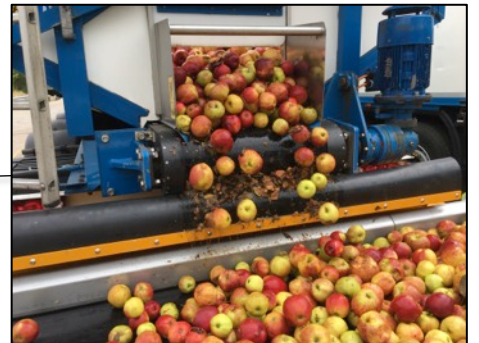
Discharge from lorries onto infeed conveyor, lorry buffer stops lorry ready for discharge