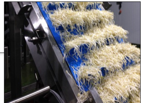
Elevating product up to a multihead weigher situated on a high level platform