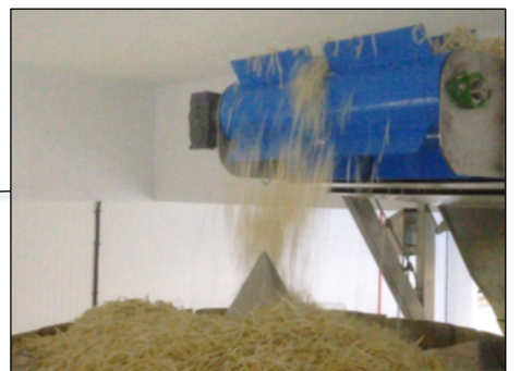
Discharge from the elevator on to the multihead weighing unit