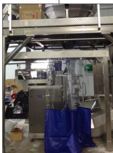
Discharge from high level multihead weigher in to low level bagging unit