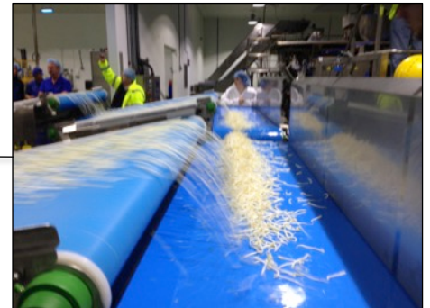
Root removal conveyors discharging onto cross conveyors.