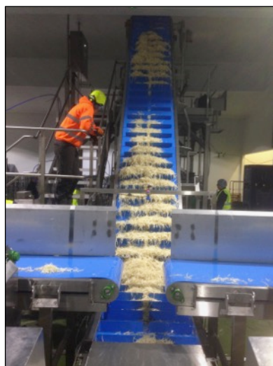
Overview of cross conveyors, elevator, and support platform