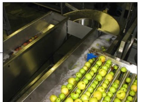
Product discharges into a pump tank and are flumed into the product pump