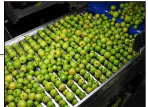
Conveyor transporting product from polishers to a roller inspection conveyor