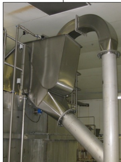
Product is pumped to high level elsewhere in the factory