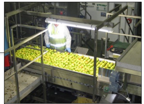
Product being inspected for quality on the roller inspection conveyor