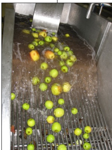
Product de-watered for further processing, and water is fine filtered and recycled to pumping system