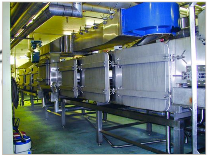
POTATO PROCESSING EQUIPMENT