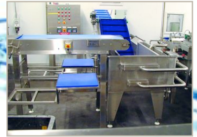
WASHER & FEED