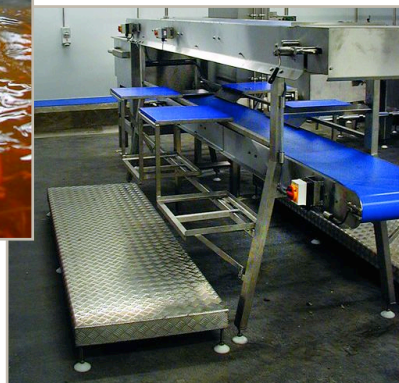
TRIM & INSPECTION