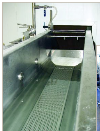
MANUAL DISCHARGE GATE