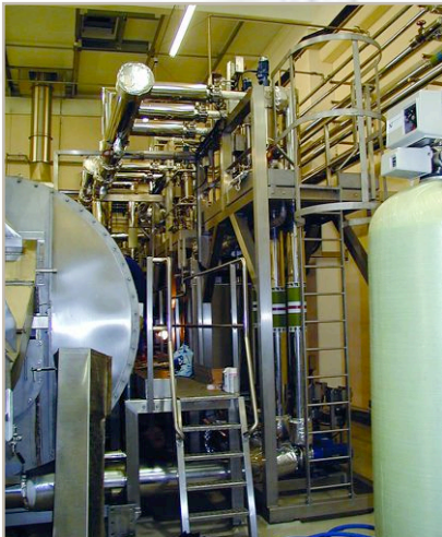
ACCESS TO HEATED CIRCULATION MAIN