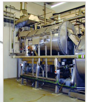
HOT WATER COOKERS