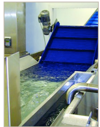
FLIGHTED BELT DISCHARGE OPTION

Whatever your product Ambit will have the washer for it!