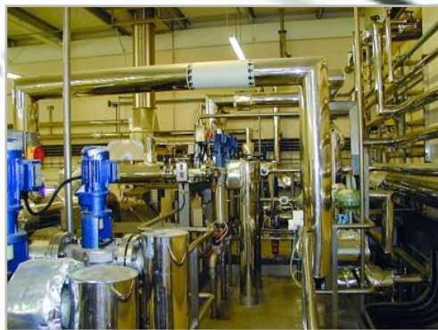
SERVICE PIPE WORK